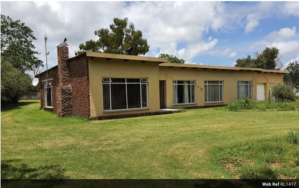
Web Ref RL1417